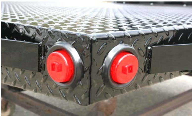
LED, PC rated, rubber mounted lighting