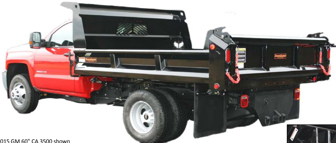
2015 GM 60" CA 3500 shown